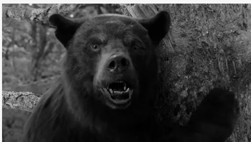
Cocaine Bear (Bab 39)