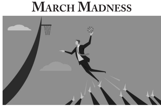
All these basketball skills are really going to make a difference at your Deloitte internship. See, "first round loss." pg. 1939.