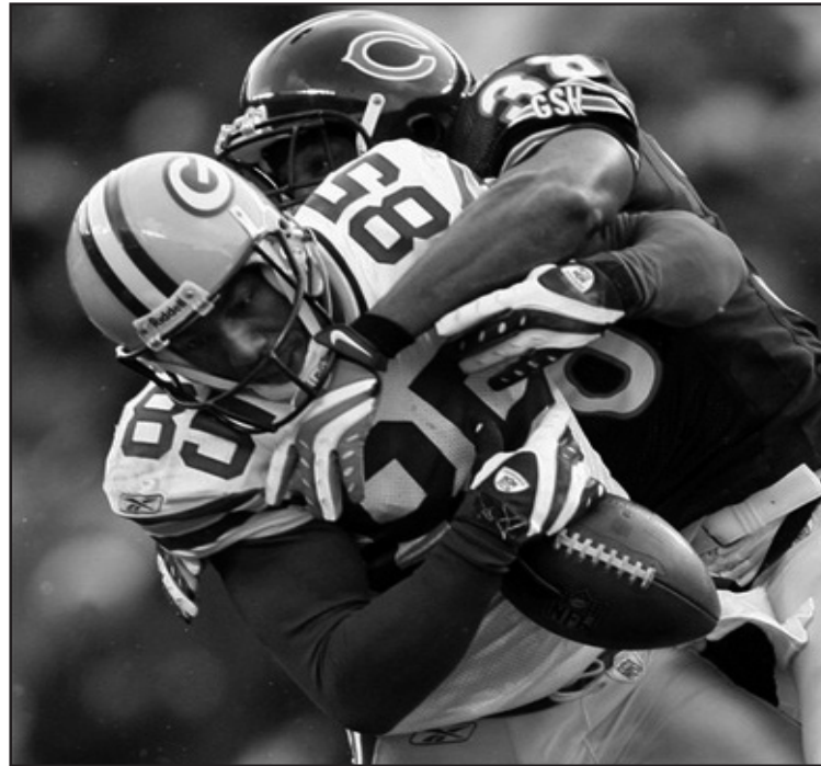
Danieal Manning (#38) tackles Greg Jennings (#85).