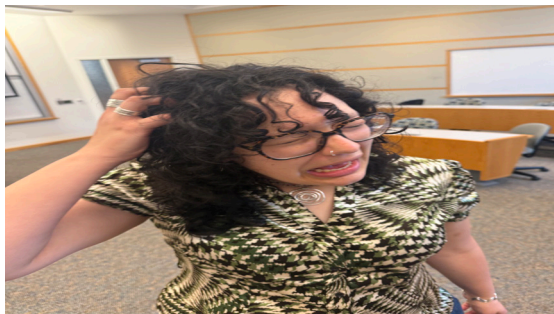
Stay back. Check your friends. See, “At least it’s not worms.” pg. 6