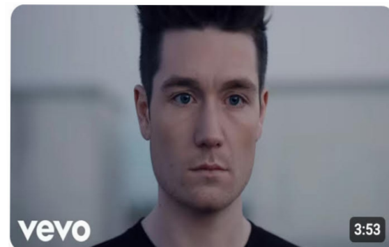
Bastille - Pompeii (Official Music Video)