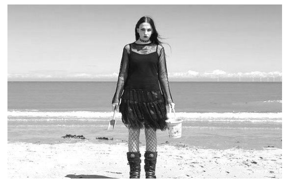
Pictured: Fun in the Sun