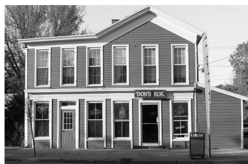
See "Between a Rok and a Hard Place," pg. 13323.