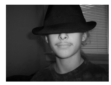
The Duel's Pope Francis