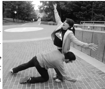
Yay, assault and battery! ;)