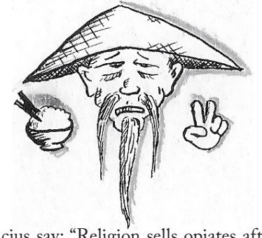
Duelfucius say: "Religion sells opiates after masses, Sunday at 1 behind the chapel."