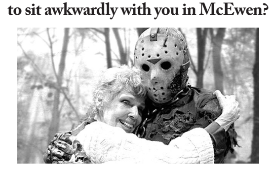
See "Too much or too little?" pg. 19.99