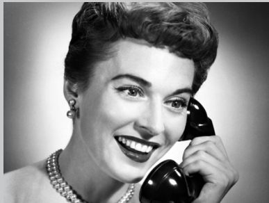
"Your hookup called me last night to say you haven't texted yet. I thought I raised you better."