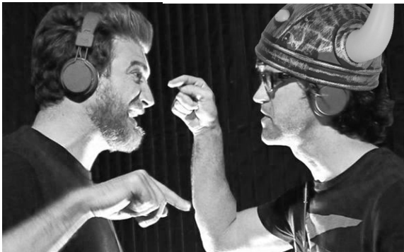
See “!!!!!!!!!!!!!!” pg. 1v1