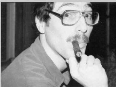
“No BBQ is complete without Mama’s special sauce and some fieldmouse meat.”