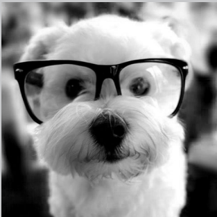
Doesn't this warm weather feel nice? The average world temperature is rising.