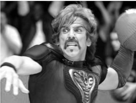
See "So appropriate it hurts," pg. one-two