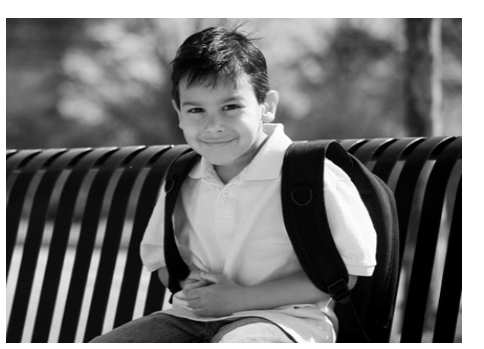
See "The field trip ended," pg. Monday