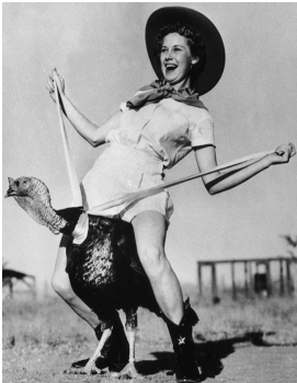
See “Can’t get down,” pg. 11/27