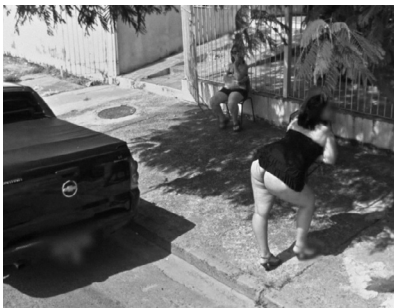
See “Why would you give us advance warning?” pg. the Wall Street Journal for some reason