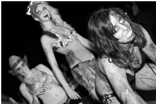
See “At least these ones will eat something,” pg. 21