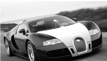
GPS comes pre-loaded with Rick Ross’s voice for directions.