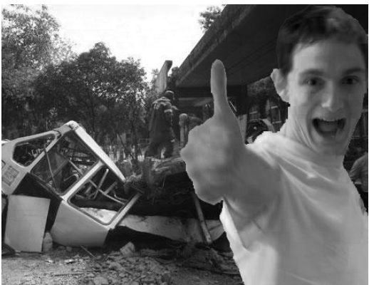
Spring break in Mexico!!!!