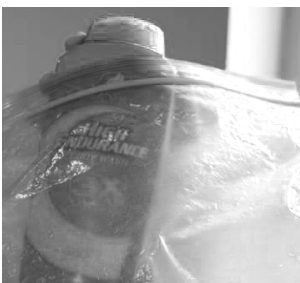
Exhibit Douchebag: Old Spice