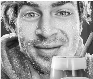
Alcoholism can't dreamily look into your eyes