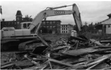
Like Habitat for Humanity in reverse

Accomplishes academic self-destruction in record time