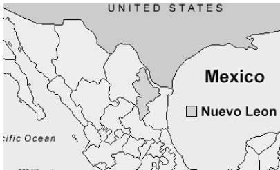
This is a subtle NAFTA joke

Unfortunately, the development of the device was mired in scandal. The construction was projected to take two years but was delayed due to two egregious engineering errors.