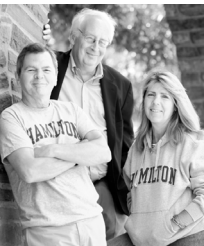
“I remember when I watched porn in Opus.”

195-200: Prepare yourself for a brunch with your entire History of Science class at your professor’s house. In honor of Sir Francis, she’s making Bacon and eggs.