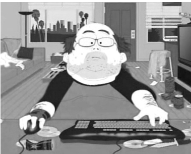
See, “Real sports respond, ‘please, take it!’” pg. 12

“I hear the whole ‘winter wonderland’ look is real in this year for the college scene,” he sighed. “Don’t major in outdoor décor, kids.”