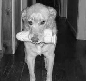
DICK IN THAT BITCH'S MOUTH

My Class & Charter Day was _____ (adjective)! I started out waking up at around _____ (time period) to the sound of _____ (sex noises) from the _____ (sorority) girl next door. Inspired by their debauchery, I decided to party it up like _____ (recently deceased celebrity) and start my day with a shower _____ (alcoholic beverage) and _____ (something that's illegal in at least four states).