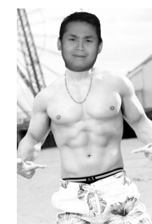
“Potato Salad would ruin this.”

lodged halfway through that _____? _____!”** (noun) (expletive)