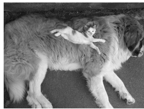
St. Bernard: So, I got an x-ray, and it turns out I misunderstood 'eating pussy.'