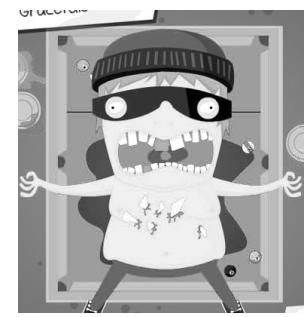
See, "The main qualification is the will to try,"