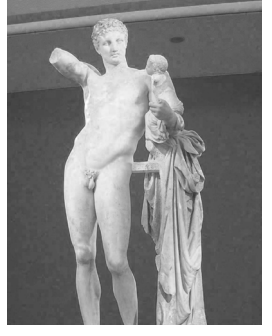
Check out his beacon of free intellectual

As a beacon of free intellectual thought in a world plagued by close-mindedness, this course will continue to make the college catalogue more progressive than it was in the days of courses focused on thought! And by 'bea-nude Greek gentlemen con,' we mean penis. nude Greek gentlemen.