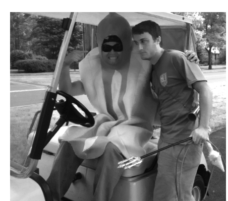
See "The Bratwurst Bodysnatcher," pg. 8