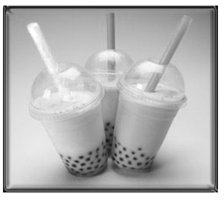
These tapioca balls are just a projection of your subconscious

One of the injured students, Melanie Johnson '13, remains under psychiatric evaluation after the incident.