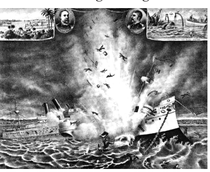
The U.S.S. Patriarchy was blown up by a Spanish mine at Havana Harbor in 1898

However, many students were indifferent (average 38%) to all polled items, revealing a "don't