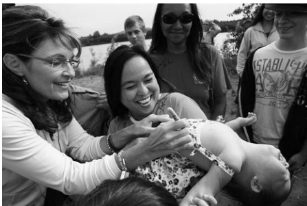
Former Gov. Sarah Palin sacrifices baby to Republican Idol Ronald Reagan

Comments? Email duel@hamilton.edu Complaints? Or find us on the interweb! Recipes? http://students.hamilton.edu/duel/