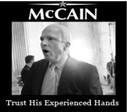
Subliminal Message: The liberal media commands you to vote Obama, or you’re a hillbilly racist who will go to hell and get cornholed by Beezlebub.

Granted McCain is old as all hell, and has trouble with facial expressions, but his trigger finger is arthritis free. And suppose the aliens capture him, let us all remember ’Nam. This guy lived in a cage for five years; he can take an anal probe like W. took Wall Street: straight down the hole!