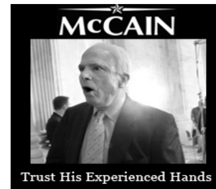
Subliminal Message: The liberal media commands you to vote Obama, or you're a hillbilly racist who will go to hell and get cornholed by Beezlebub.

Now, let us consider McCain. Save a few brief outbursts directed towards Spain and anyone under the age of 45, McCain's banality seriously detracts from the quality of his speeches. His rigid pontifications make the most patriotic citizen fall dead asleep. As dead, might I add, as McCain could be at any moment?